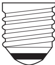
E27 IEC 7004-21