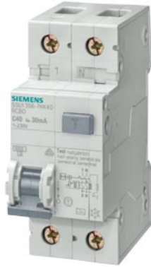
RCBO, 6 kA, 1P+N, Type AC, 30 mA, C-Char, In: 6 A, Un AC: 230 V