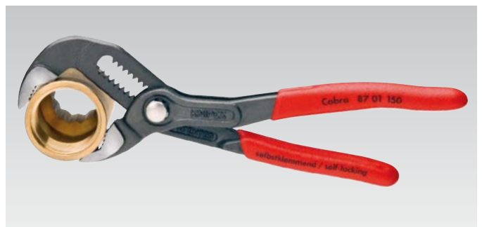
Mini-Cobra: pocket size with adequate tool function. Capacity up to 30 mm diameter