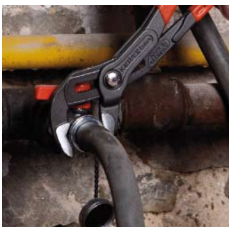
Opposing off-set teeth provide a self-gripping effect which avoids slipping off the workpiece