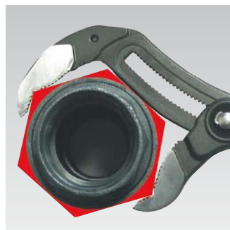
The Cobra XL (length 400 mm / 16") with a capacity of up to 95 mm / 3 1/2" exceeds by far the efficiency of a pipe wrench of the same length